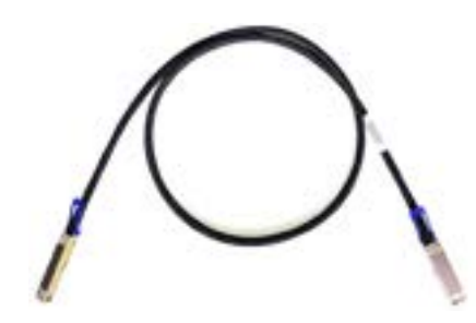
800G OSFP DAC Cable

All Volex Direct Attach Copper Cables have the same unique dielectric material and cable construction offering the smallest cable outer diameter and highest flexibility. Volex active DAC Cables can further reduce the cable OD from the passive version for the same cable length by using larger wire gauge. At less than 150mW per active channel, Volex active DAC Cables are cost-effective alternatives to the high power consuming Active Optical Cables, with superior reliability for next-gen data centres that deploy faster speeds in tighter spaces.