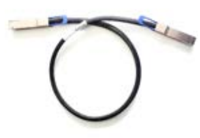
QSFP-DD800 DAC Cable