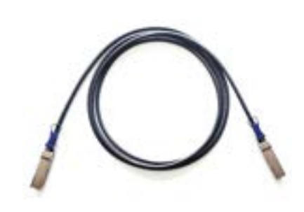
OSFP56 DAC Cable

Volex QSFP28/56 DAC Cables offer a wide range of straight and breakout variants to support the needs of today's 100Gbps Ethernet data centres and to facilitate the transition to 200Gbps and 400Gbps port speeds. The active SFP28/56 and QSFP28/56 DAC Cable can extend the reach up to 9M for both 25G NRZ and 50G PAM4 channels vs. max 5M (25G NRZ) and 3M (50G PAM4) reach for the passive version. For SFP28 and QSFP28 active DAC Cables, IEEE CA-25G-N spec can be met for full in-rack cabling length to support no FEC for low latency applications.