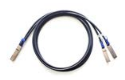
QSFP-DD to 2x QSFP56 Breakout DAC

Volex QSFP-DD active and passive Direct Attach Copper Cables double the number of lanes of the previous 100/200Gbps generation QSFP28/56 from 4 to 8. Volex QSFP-DD cables support 200Gbps with 25Gbps/lane NRZ modulation and 400Gbps with 50Gbps/lane PAM4 modulation for a reach up to 5 and 3 meters, respectively. Thanks to unique foam dielectric construction, Volex QSFP-DD cables offer smallest cable outer diameter and bend radius and highest flexibility. The active QSFP-DD DAC Cable, with its ability to compensate for signal loss and enhance Signal Integrity, can extend the reach up to 9M for both 25G NRZ and 50G PAM4 channels vs. max 5M (25G NRZ) and 3M (50G PAM4) reach for the passive version.