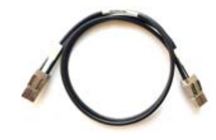
Mini-SAS HD 8X